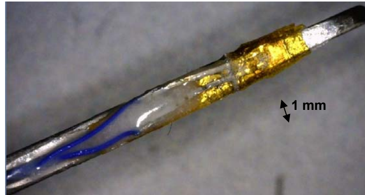
Final view of strain gauge bonded onto the hook of the needle. Special Teflon insulated cables are inserted into the machined channel