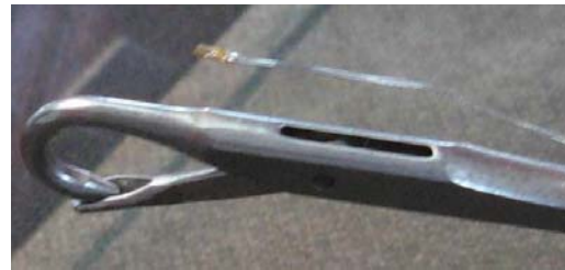
120 \Omega 1 mm X 1 mm size small strain gauge positioned at the top of hook region