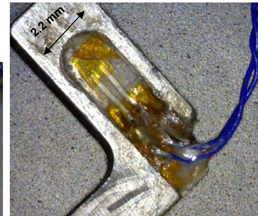
The second strain gauge bonded inside the cavity of the needle.